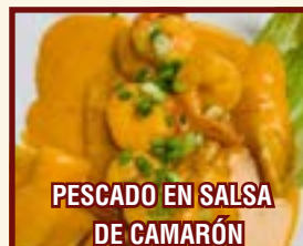
PESCADO EN SALSA DE CAMARÓN

Steamed fresh basa fillet seasoned w/ Peruvian herbs, onions, tomatoes & cilantro served w/ white rice on the side