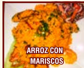
ARROZ CON MARISCOS

A delicious sautéed of mixed seafood or shrimp w/ onions, tomatoes & green peppers. Served over fries w/ a side of rice